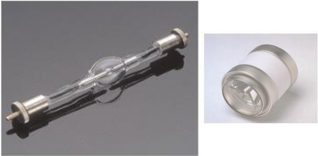
Figure 2. Photos of a conventional Xenon arc lamp (left) and a Cermax lamp (right).

The 300W Cermax lamp is a compact and rugged light source whose bulb, built in ceramics, encloses the electrodes and an internal pre aligned parabolic reflector built around the anode. The lamp can be utilized in any position. The built-in reflector is vacuum deposited onto the precision ceramic surface. The total light produced by the lamp is emitted in one direction only, that is, the axis defined by the electrodes. The light beam is distributed in a cone of 10° around the axis. A lens (condenser) placed in front of the lamp collects the total light emitted by the lamp (Figure 1). The geometry of this lamp allows it to collect around 90% of light.