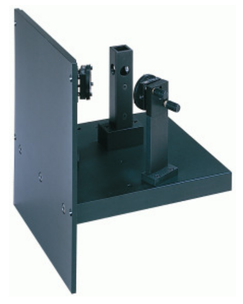
Figure 1. Absorption Accessory - Side View.

The ISS absorption accessory enables measuring of the wavelength-dependent optical density (OD) of a sample on PC1 or K2<sup>™</sup> spectrofluorimeters. The transmitted intensity follows the Lambert-Beer law for non-scattering, optically homogeneous non-aggregated samples [1]. Highly scattering samples, aggregates or fluorescent samples require additional correction. This accessory is installed in place of the sample compartment in K2 or PC1 spectrofluorimeters [2].